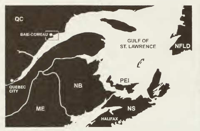
FIGURE 1. Location of Greenland Shark sightings in the St. Lawrence River in the vicinity of Baie-Comeau, Province of Quebec.